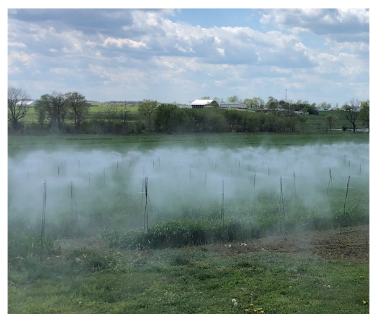
Figure 4. Irrigated, Inoculated Scab Nursery, Lexington, KY 2021.

off for vomitoxin (DON) analysis showed high levels in some cases, which indicates a late infection. The good news is that we have genomic predictions of scab resistance on most of our lines which is like having another set of data to help us make decisions.