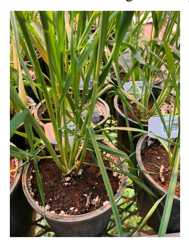
Figure 3. Wheat plants in greenhouse for crossing.

Crossing : We produced approximately 400 crosses in the greenhouse this season, both single cross hybrids between 2 parental lines and 3-way crosses in which we cross the hybrid with a third parent. We are planting the single cross hybrids in the greenhouse this fall for an additional round of crossing; they will go into the vernalization chamber in the next week. The 3-parent F_1 hybrids produced in the greenhouse will be planted in the field at Lexington this fall to produce F_2 seed. To design some crosses, we will use genomic crossing software that predicts the most productive crosses to be made, based on genomic and field performance information from the parents. The majority of our crosses, though, will be made on the basis of field performance combined with information about which disease resistance genes are present in which parents.